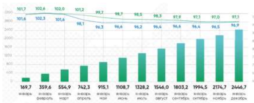
Figure 4. Dynamics of changes in the gross regional product (GRP) of the Republic of Tatarstan during 2020 compared to 2019