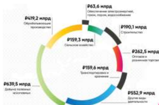
Figure 5. Structure of the GRP of the Republic of Tatarstan in 2020 in rubles