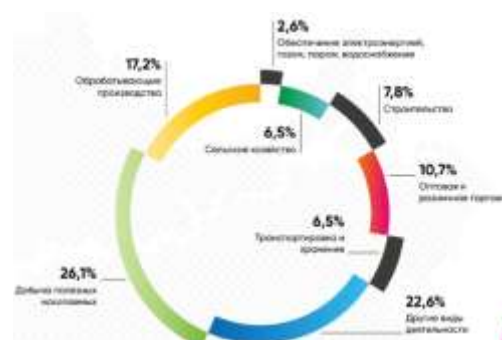
Figure 6. Structure of the GRP of the Republic of Tatarstan in 2020 in per cents