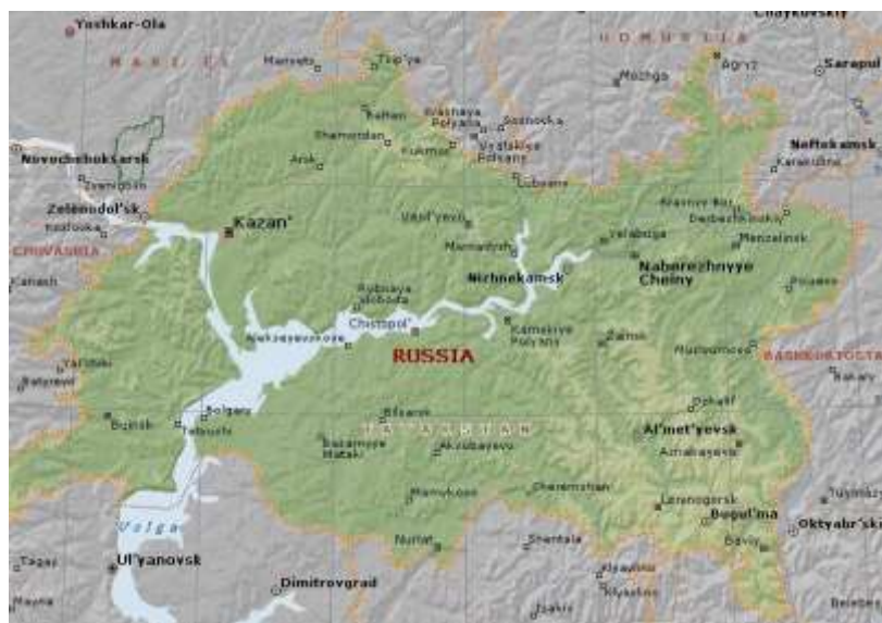
Figure 1. The map of the Republic of Tatarstan